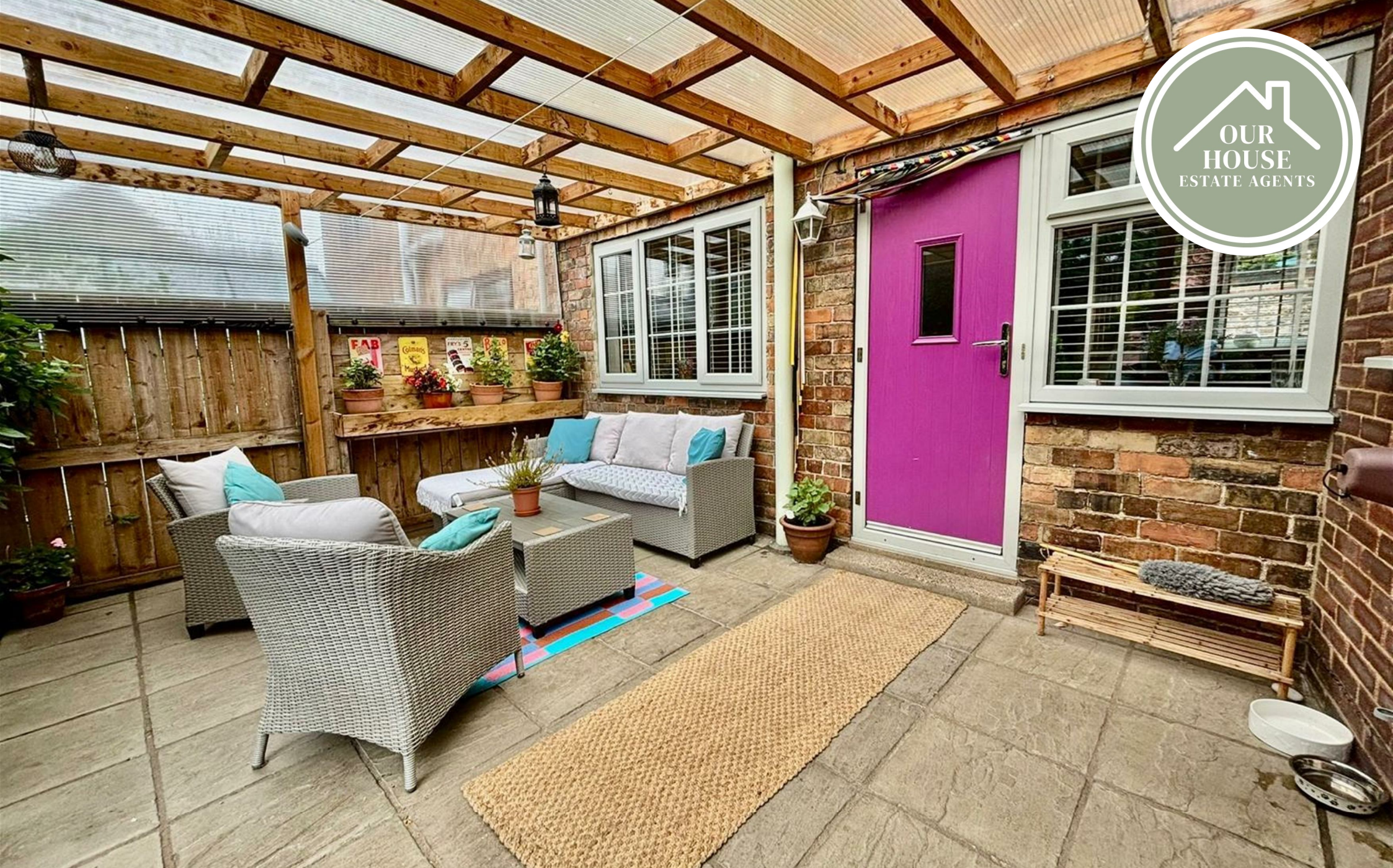
Lavender Cottage 2 Back Village Green, Atwick, YO25 8DN